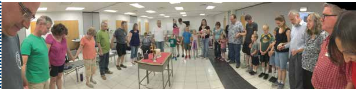
Family prayer time at one of the Marriage Encounter team meetings.