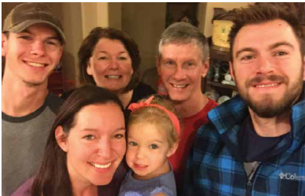
The Fowler family.

Here in the East Texas Area, Worldwide Marriage Encounter weekends are offered five times a year. Each weekend is guided by a team of sharing couples and a priest, and includes practical tips and strategies for strengthening marriages, testimonies from sharing